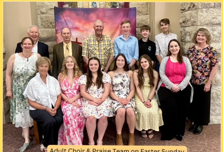
Adult Choir & Praise Team on Easter Sunday

Signup for the summer trip to Valleyfair will open May 5 for students completing grades 6-12. We meet at RLC at 8 a.m. and leave Valleyfair around 3 p.m. The cost is $50/student; $10 less for students that helped with Living Color flower sales and $10 less for students that help with the Royal Ball/Cattlemen's meal. The price includes admission to the park AND the bus ride. Valleyfair has a waterpark as well as "dry" rides, so students should plan to bring a towel and/or extra clothes if they plan to use the waterpark. Valleyfair is CASHLESS. Students should plan to pack a lunch, bring electronic payment or purchase a meal plan online ahead of time. See their website for further details. Watch email for further info. Need not be a member of RLC to participate, or to qualify for the discounts.