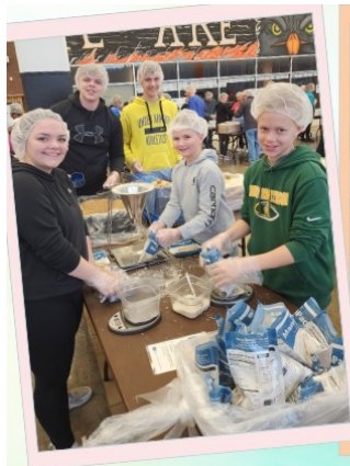
Confirmation students participating in Feed My Starving Children.